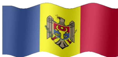
Republic of Moldova